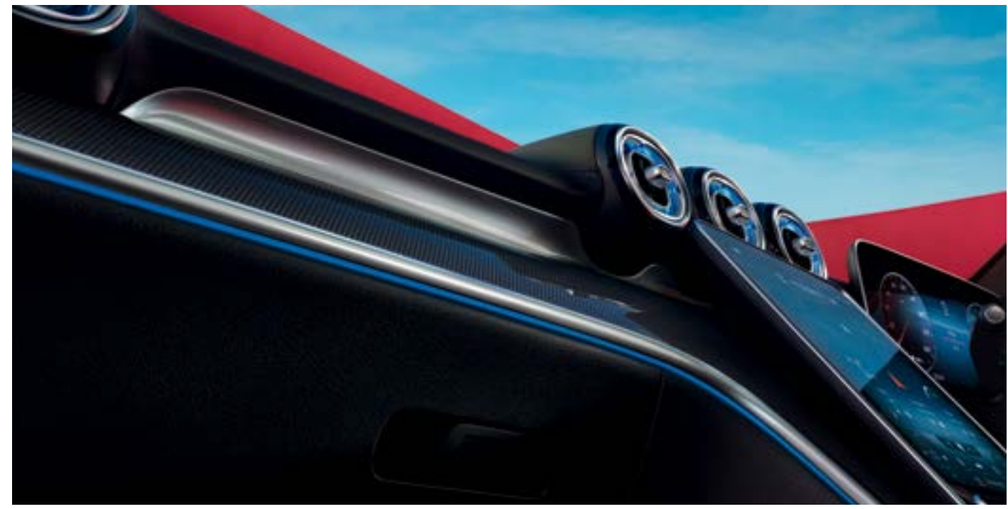
A space in which to feel good.